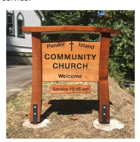
Our New Sign!

PICC is a Christ centred church. Maybe you have been away from church for a very long time or never even been in a church but if you feel the gentle call of Christ we invite you to come check us out!