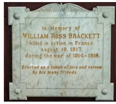
Wm. Bracket Memorial

2 Peter 3:9 "The Lord is not slow to fulfill his promise as some count slowness, but is patient toward you, not wishing that any should perish, but that all should reach repentance."