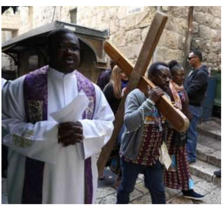
A Good Friday procession – some of the thousands of annual pilgrims in Jerusalem – 2019